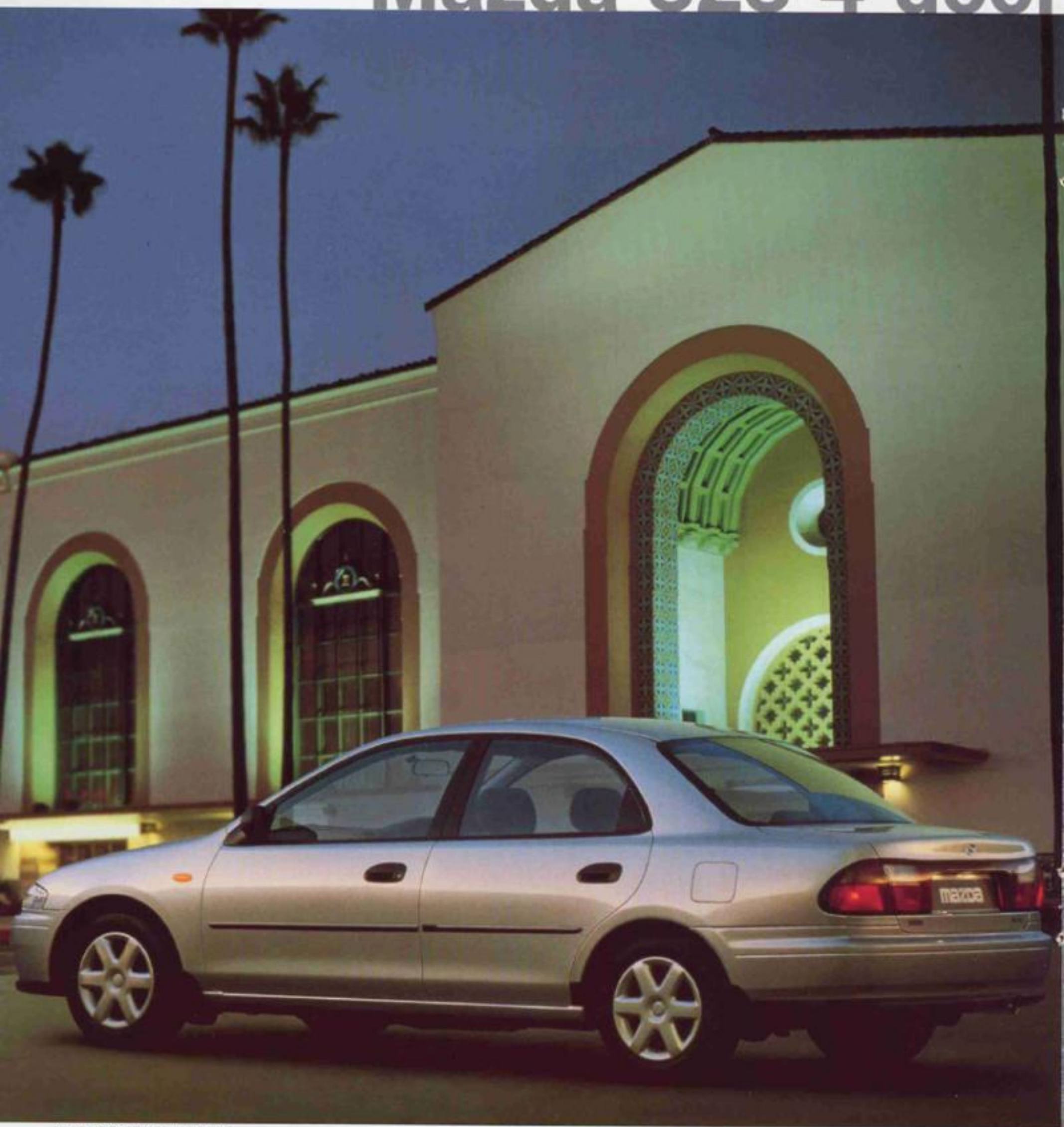
Mazda 323 4dr Saloon 1.5i GXi