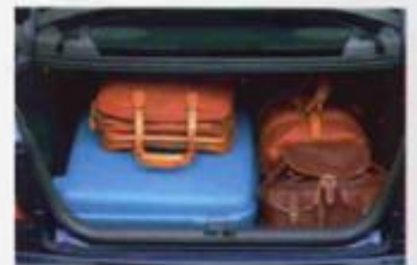
Spacious luggage compartment