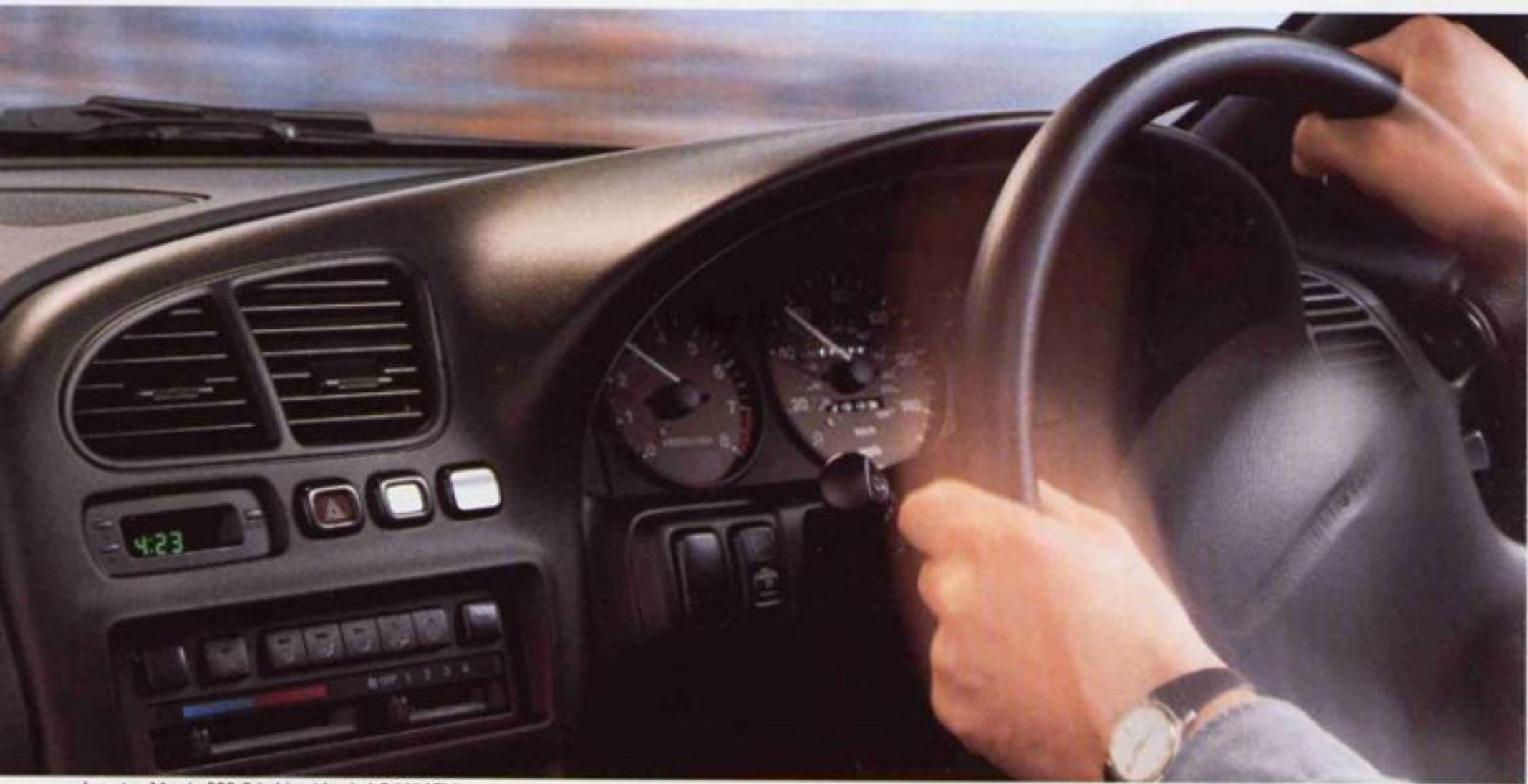
Interior Mazda 323 5dr Hatchback 1.5 LXi/GXi

The 323 driver's seat is contoured for back and thigh support. Shoulder supports firmly brace the driver's body against lateral G forces produced by hard cornering. The seat is fully adjustable for you to find your most relaxed driving position.