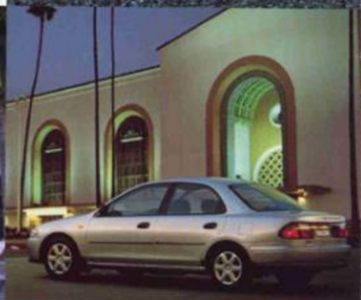
Mazda 323 4dr Saloon