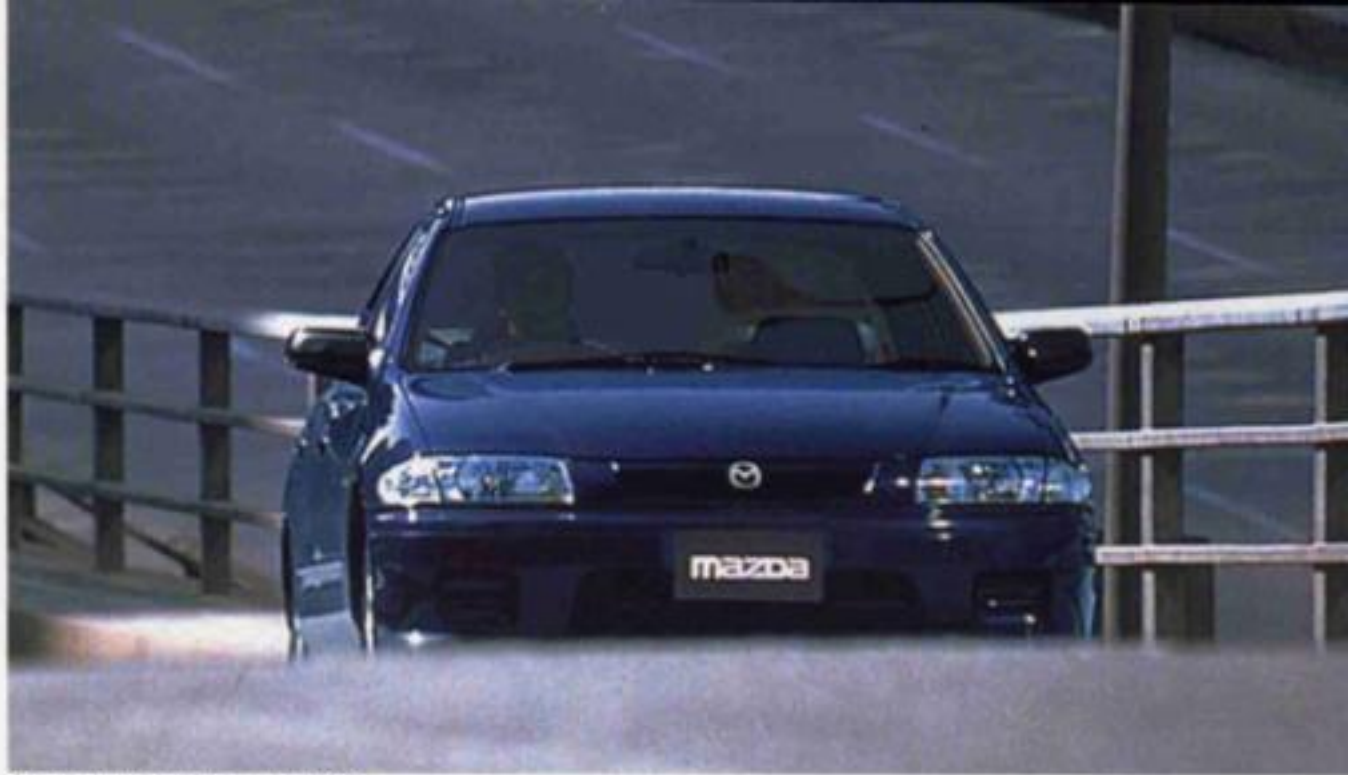
Mazda 323 4dr Saloon 1.5i GXi

The Mazda 323 4 door saloon combines sophisticated design with superior handling. Its unique forward location of the passenger compartment provides an unusually large volume of interior space.