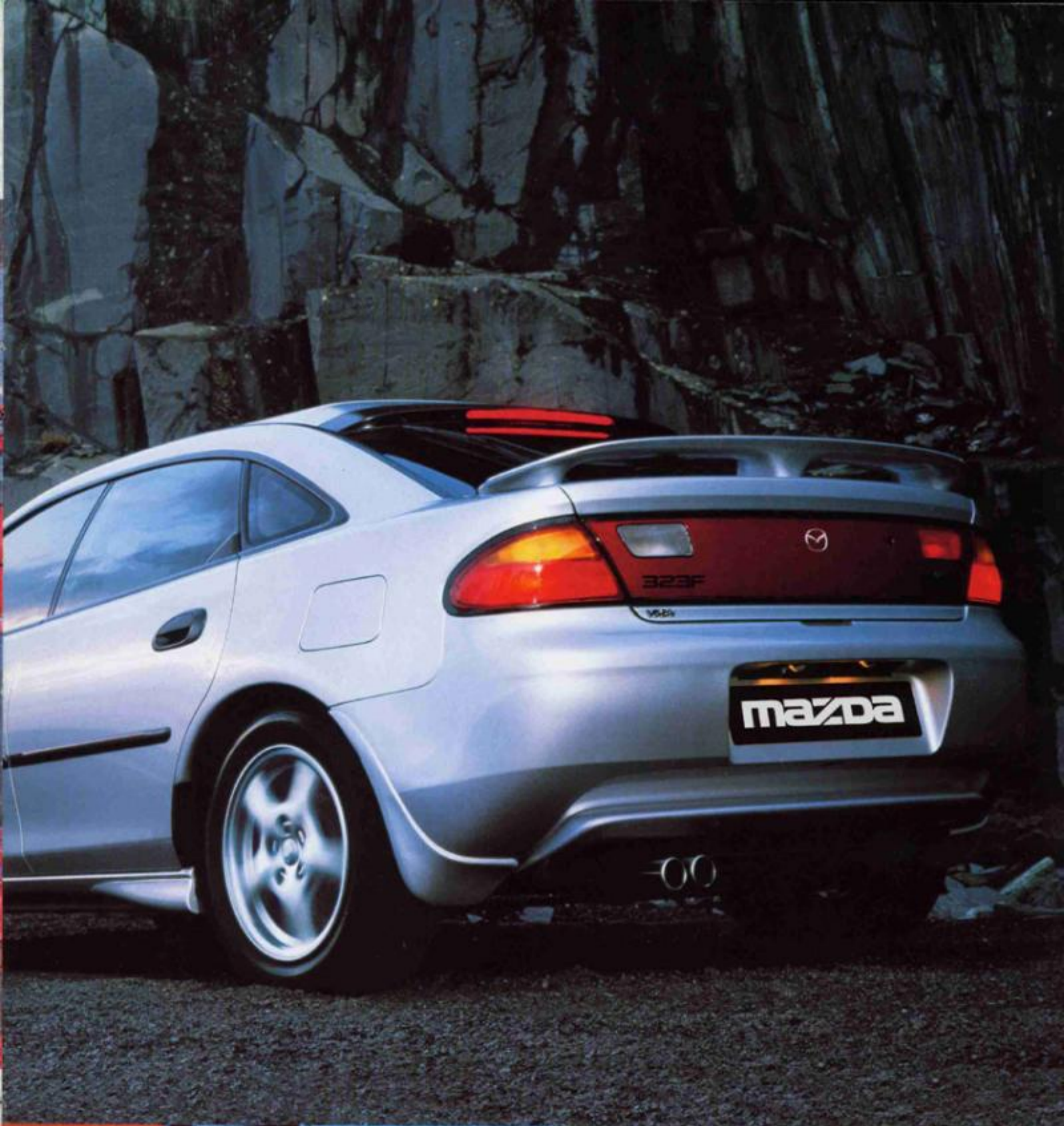
Mazda 323 5dr Hatchback