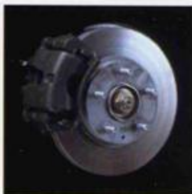
Ventilated front disc brakes