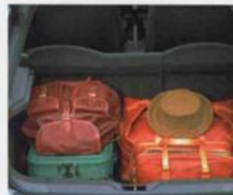
Spacious luggage compartment