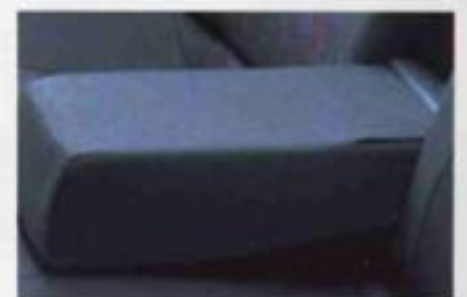
Rear centre armrest