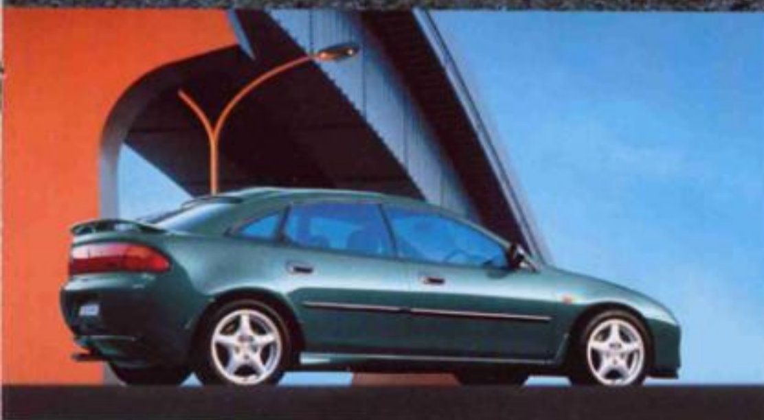
Mazda 323 5dr Hatchback