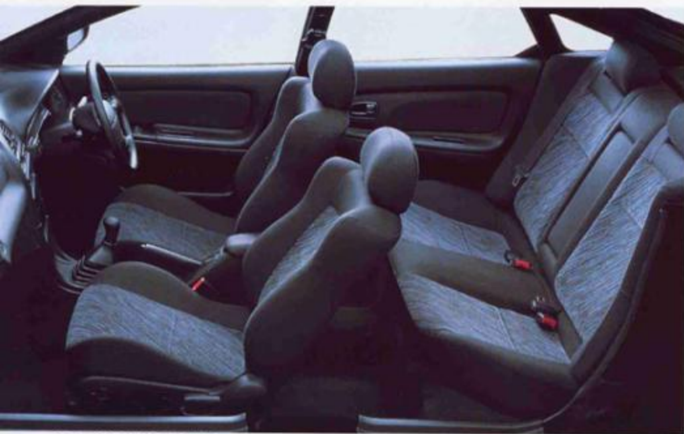
Mazda 323 5dr 2.0i ZXi V6 24v interior