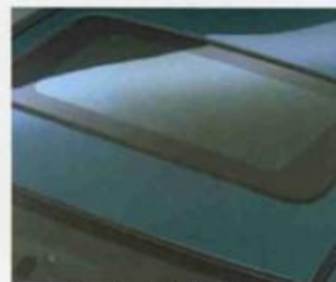
Sunroof on 3dr 1.5i GXi only