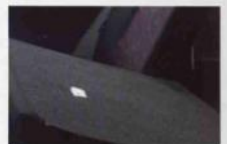
60:40 split fold-down seat