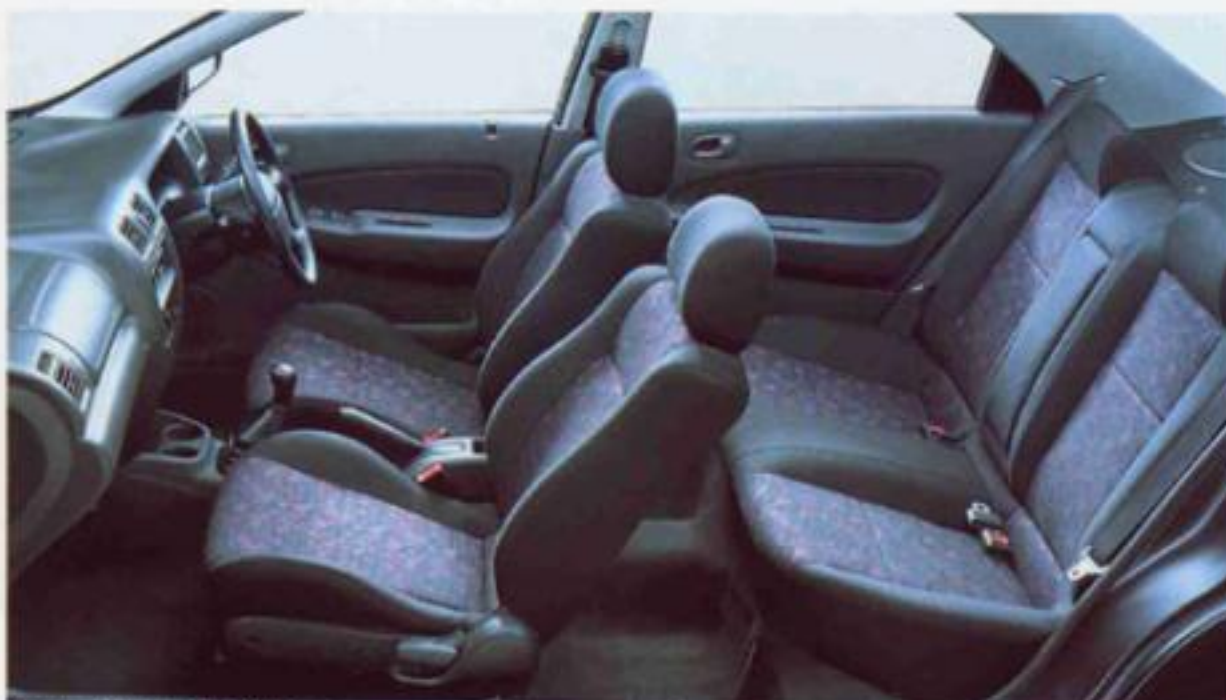
Mazda 323 4dr 1.5i GXi interior

Powerful ventilation and heating systems allow sensitive control of the car's interior temperature. A rear seat centre arm rest, conveniently placed switches for electric windows and a centre console box for items like cassette tapes, all help to make the Mazda 323 4 door saloon a very civilised car.