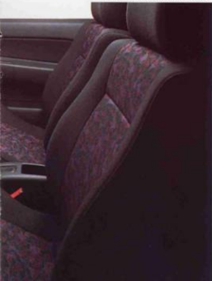
Interior Mazda 323 3dr 1.5i GXi