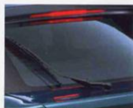
High level brake light