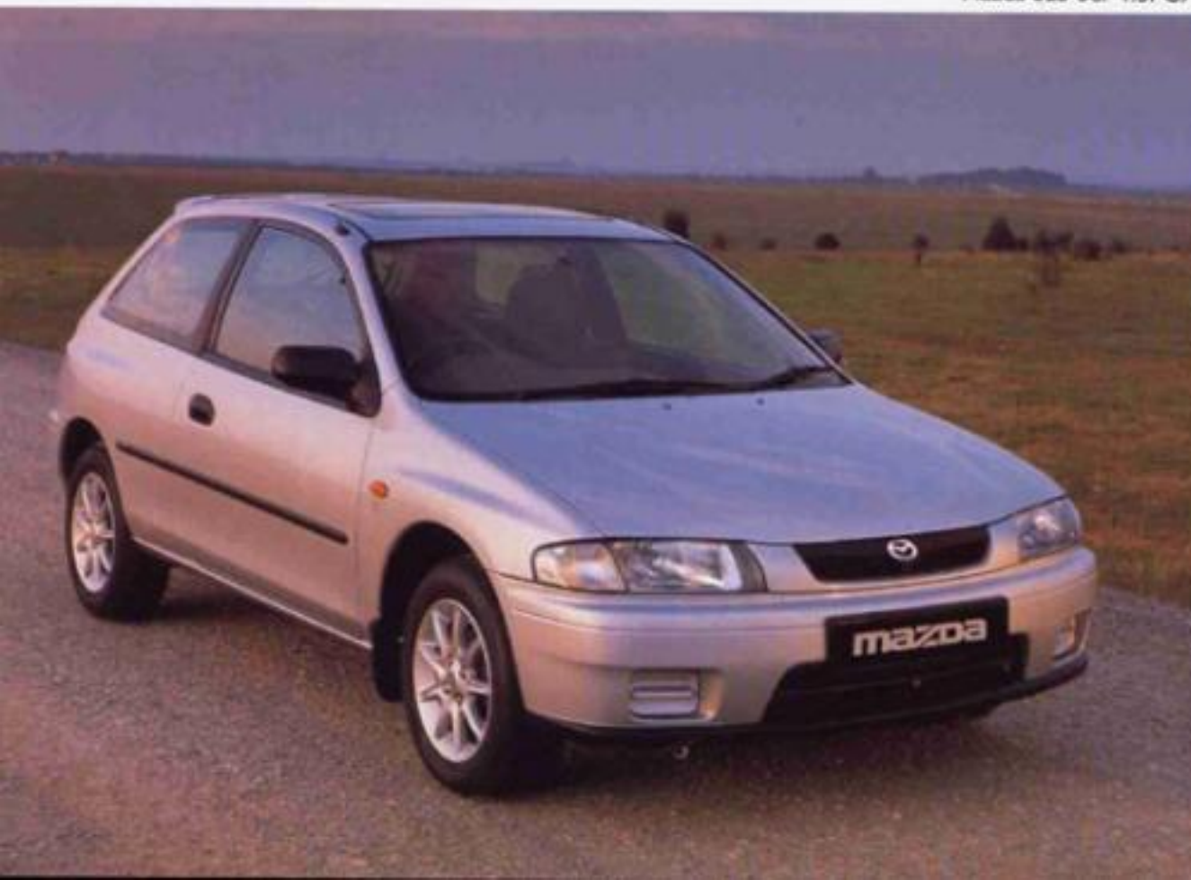
Mazda 323 3dr 1.5i GXi