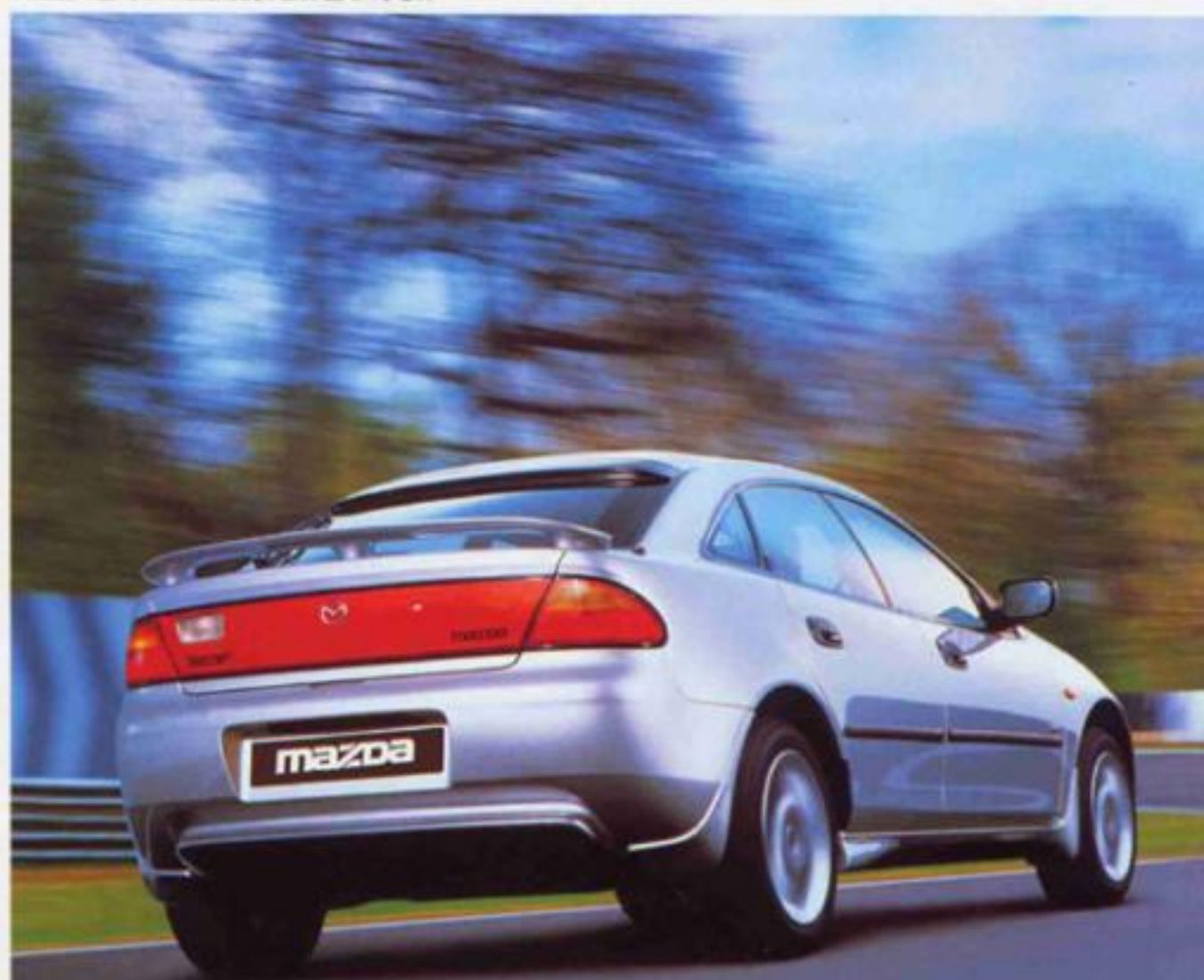
Mazda 323 5dr Hatchback 2.0i ZXi V6 24v