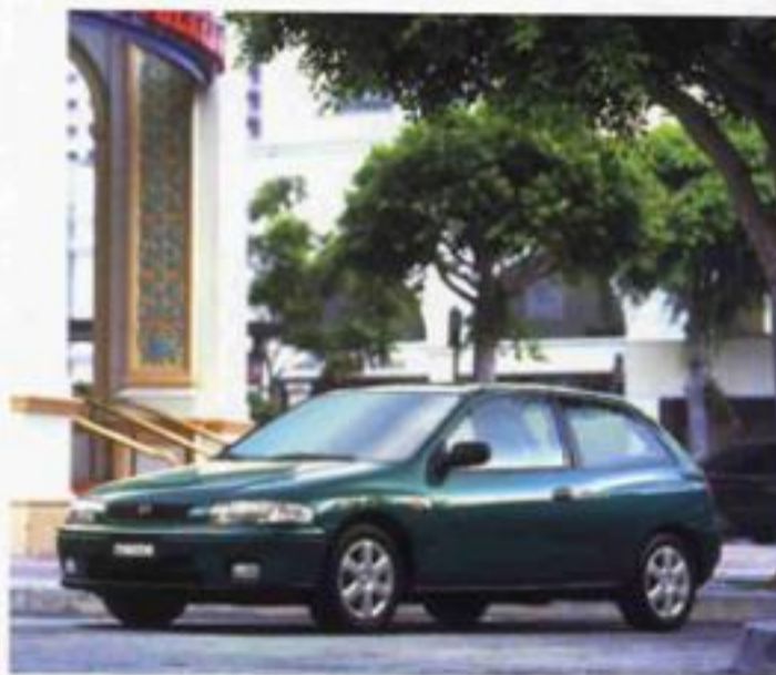
Mazda 323 3dr Hatchback