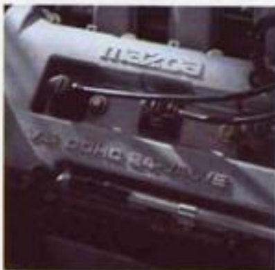
Mazda V6 DOHC 24-valve