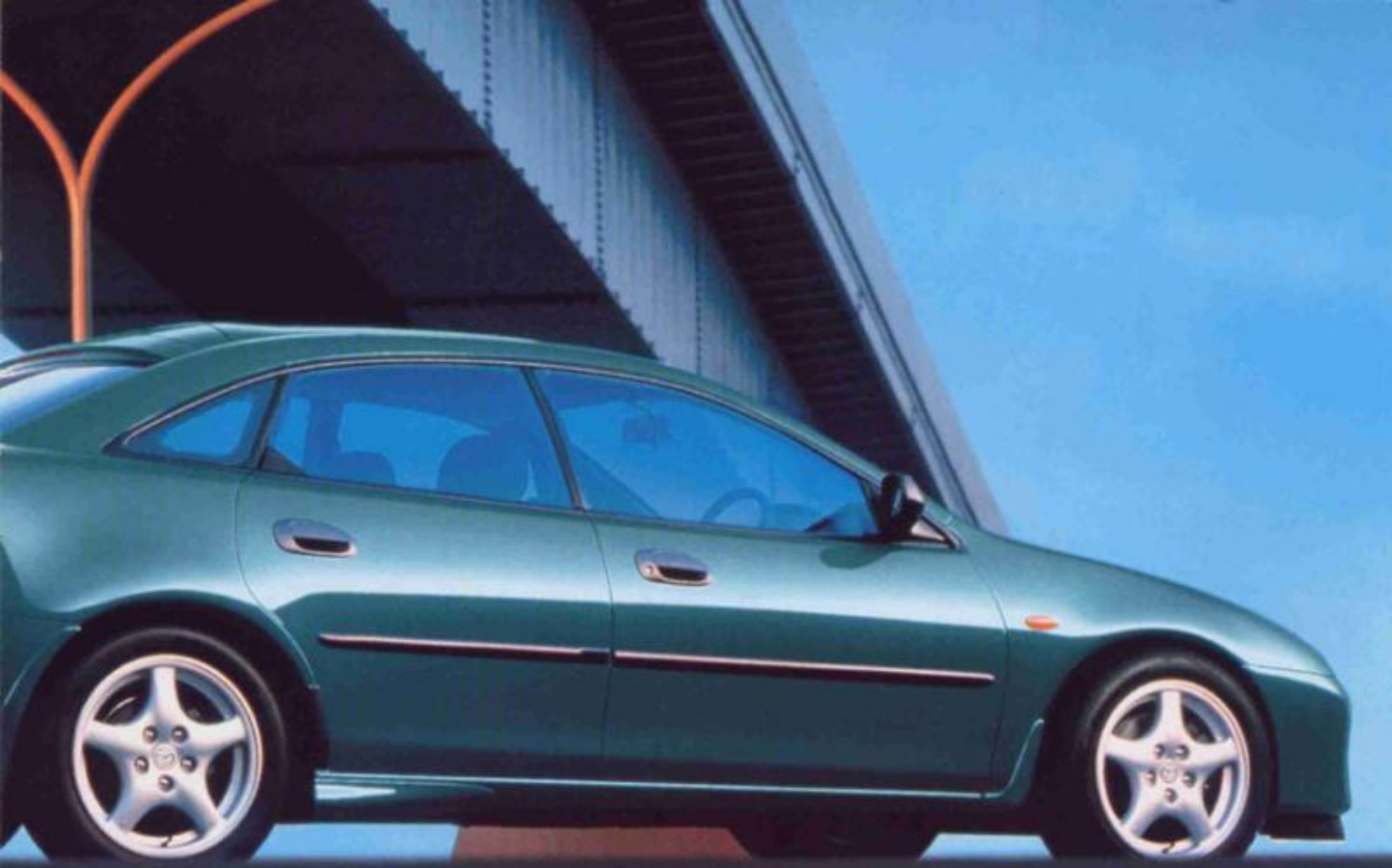
Mazda 323 5dr Hatchback 2.0i ZXi V6 24v